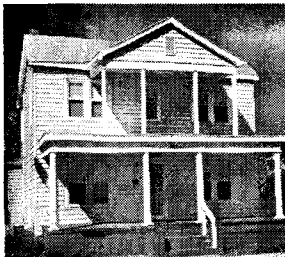
The Central Day Center 411 N. 4th Street Hours: M-F 8:00am - 5:00pm

The Wilmington Interfaith Hospitality Network (WIHN) program unites communities of faith in a collaborative effort to assist families facing economic hardships. On a rotating basis, thirteen "host" congregations provide accommodations and meals for three to five families (up to 14 people) for one week, four times a year. An additional 25 congregations support the host congregations, providing material, human, and financial resources to support the program. Volunteers from the congregations provide meals and support services. A central day center is located at 411 North 4th Street where a Director, a Case Manager, and a Family Nurse Practitioner work intensively with the families as they seek jobs, housing, and other resources necessary for independent living.